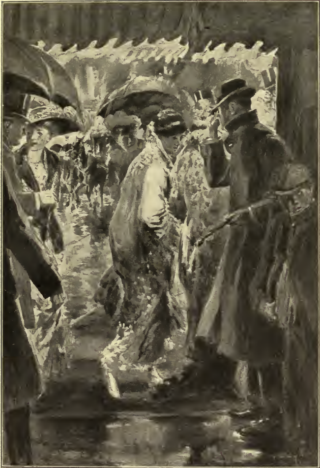
He had kept his place since the doors were opened, his keen eye searching every face that passed